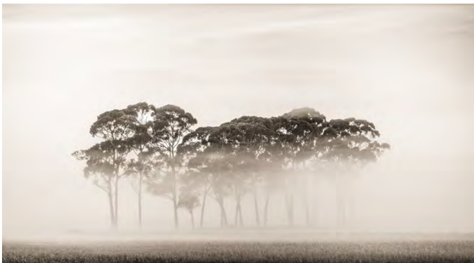
A Grade Set Subject