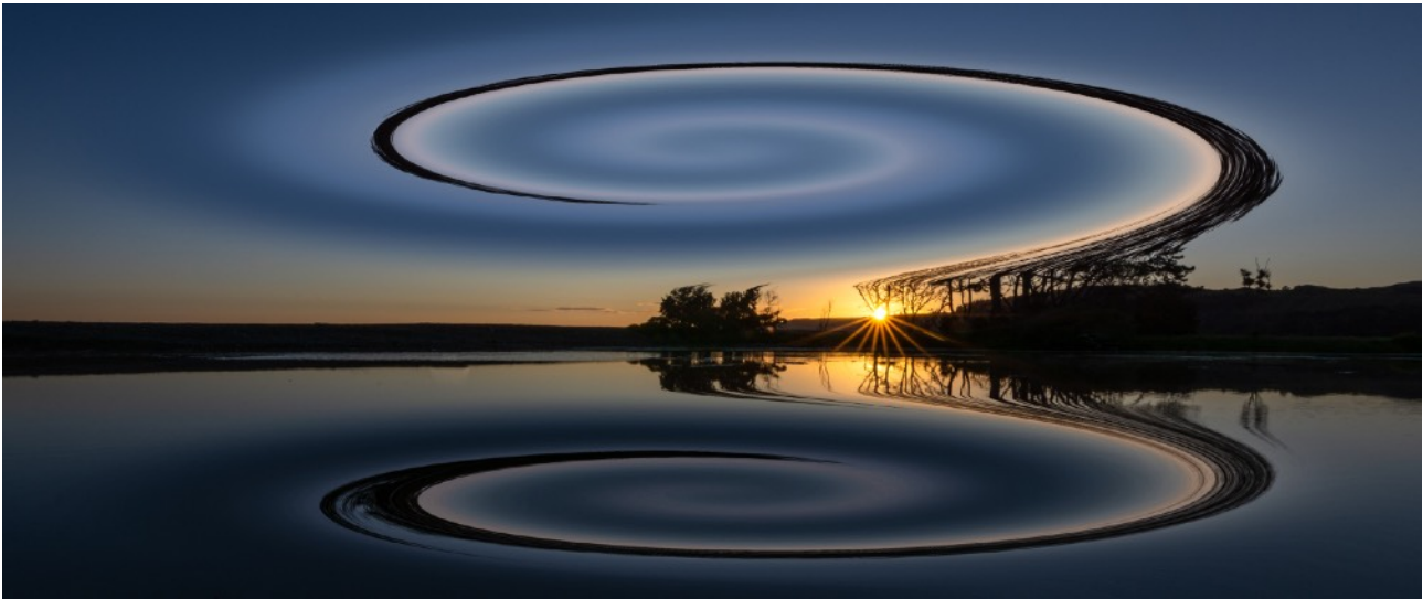
Creative: "Sunrise Reflections" by Liz Caldwell