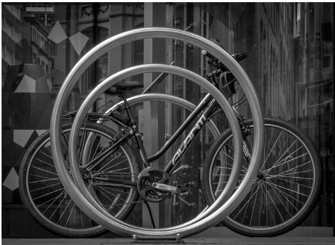
Judges Choice B Grade Set Subject "Frame it" "Cycle Circles" by Roger Hurley