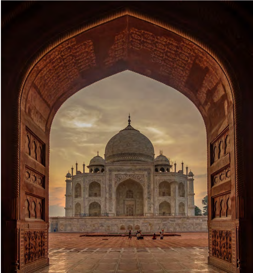
Judges Choice A Grade Set Subject "Frame it" "Crown of the Palaces" by Liz Caldwell