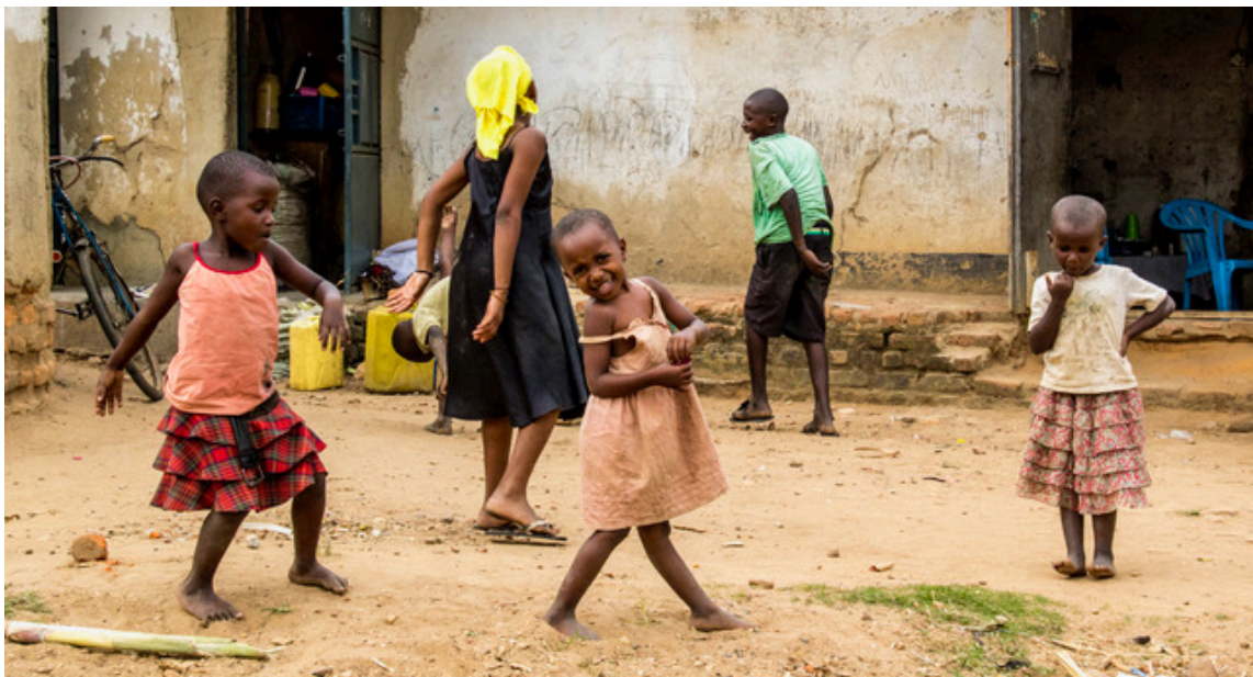
B Grade Set Subject: 'Playtime Uganda' by Lynne Roberts