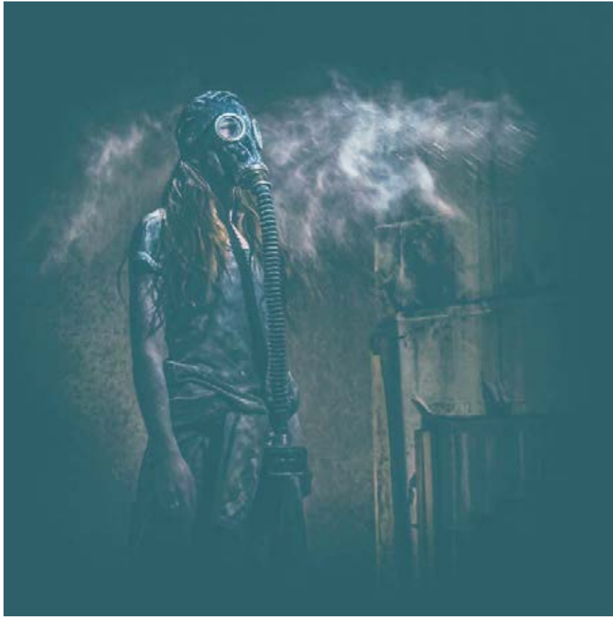
Creative: 'Gas Mask' by Sherryl Neale