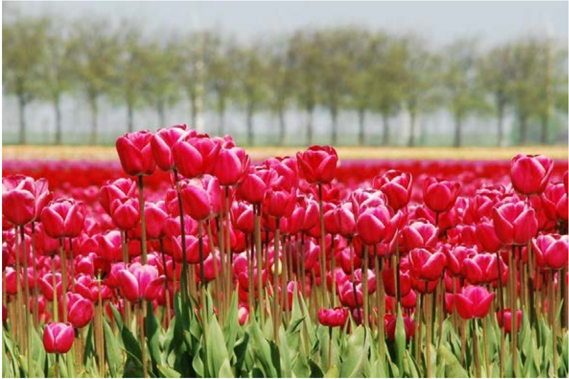
B Grade Open: 'OhSoRed' by Vivienne Waterer