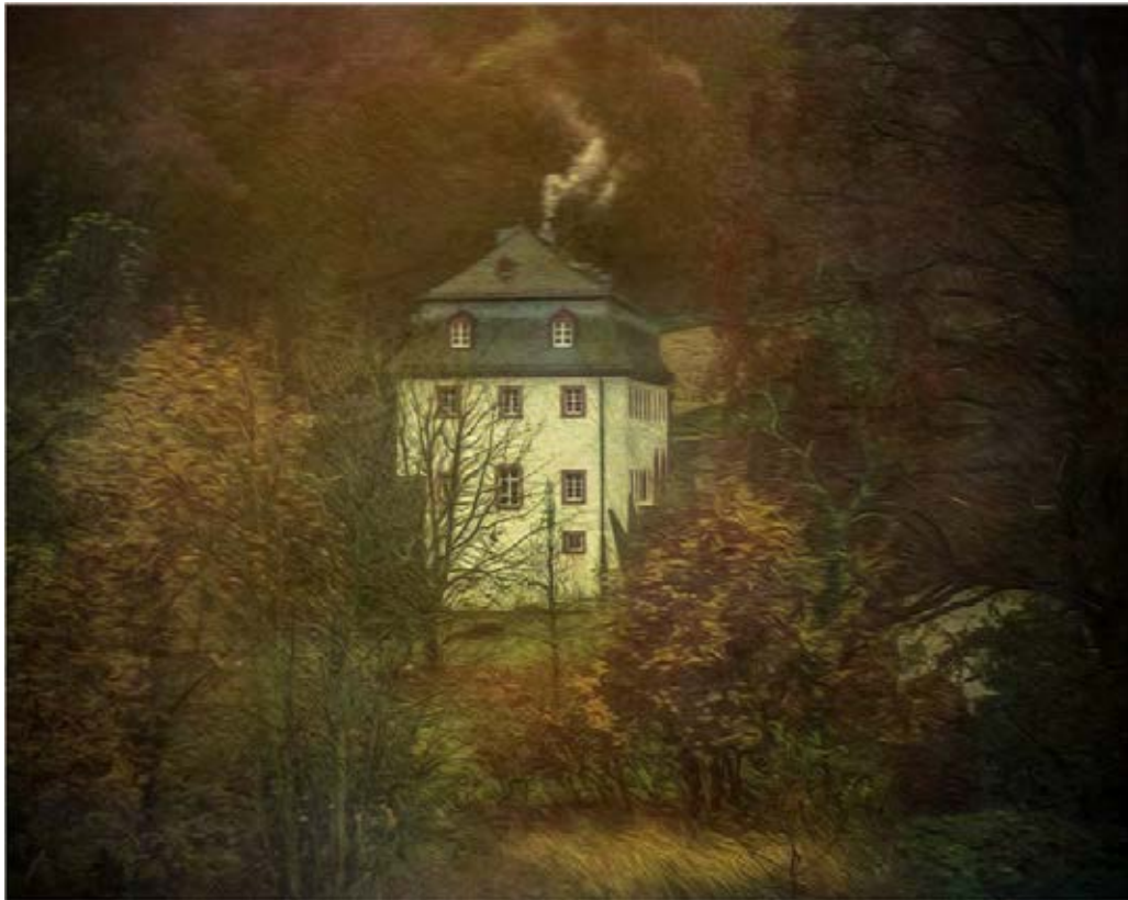
Creative: 'Winter Storm' by Greg Thompson