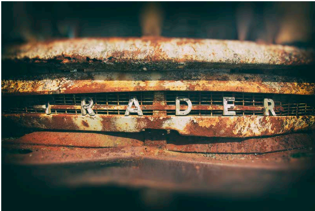
B Grade Open: 'Trader' by Tanya Houghton