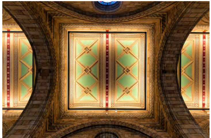
B Grade Open Subject