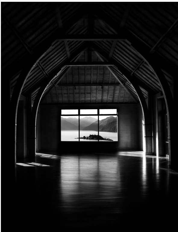
A Grade Set Subject: Backlight