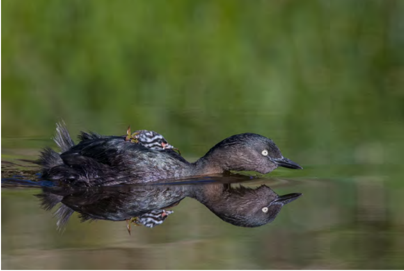
A Grade Open Subject