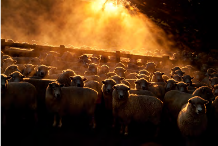
B Grade Set Subject: Backlight