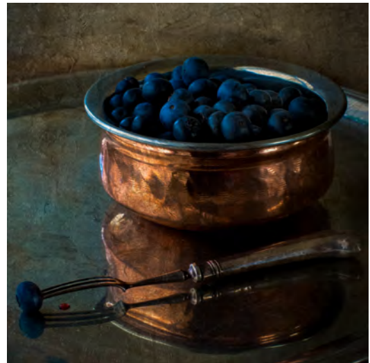
B Grade Open Subject

“Blue berries, blue berry, blue berry's blood” ” by Constance Fein Harding