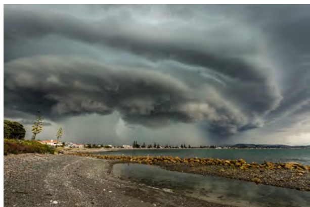
A Grade Open