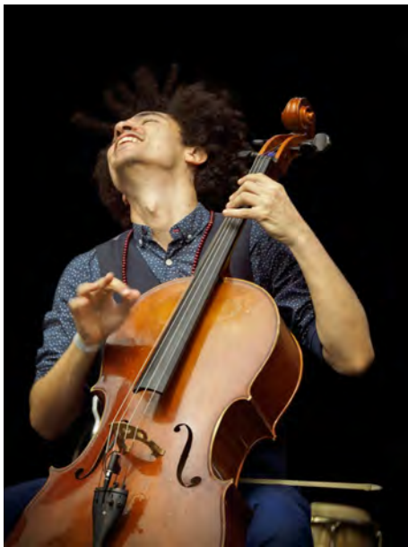
A Grade Set Subject: Tools of the Trade

“All the tools he needs... Cello and soul”