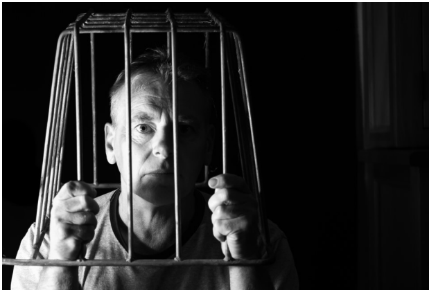
B Grade Set Subject: Self Portrait